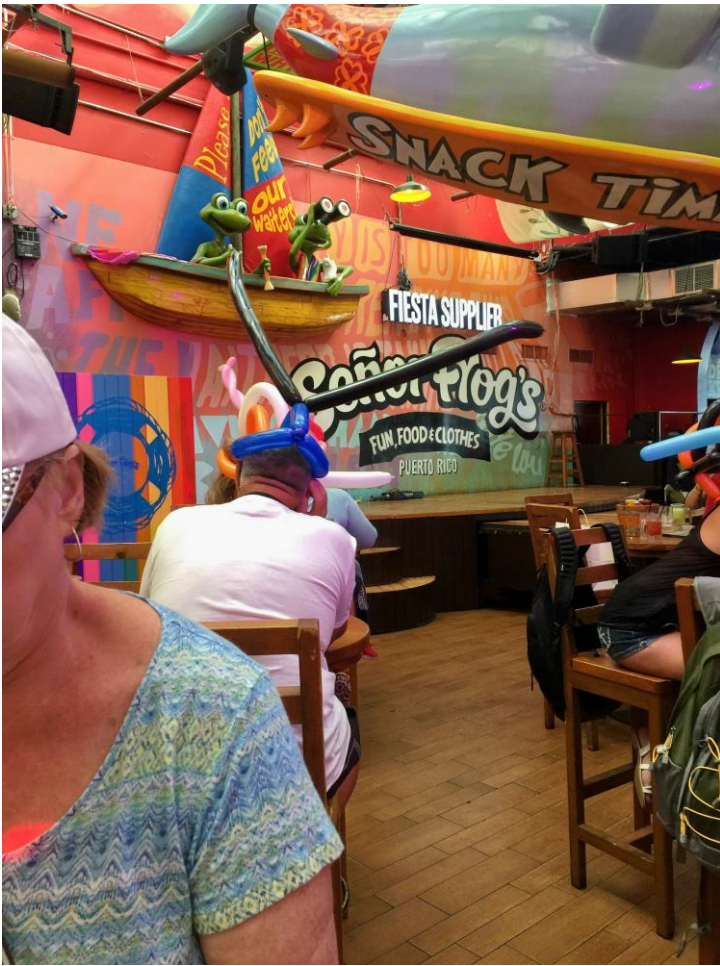
Senior Frog in Puerto Rico