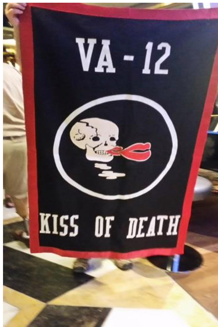
THE KISS FLAG