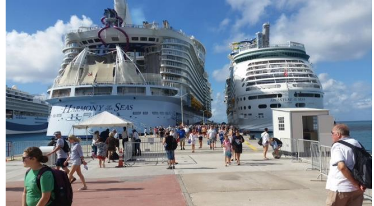
Our Ship on the Left