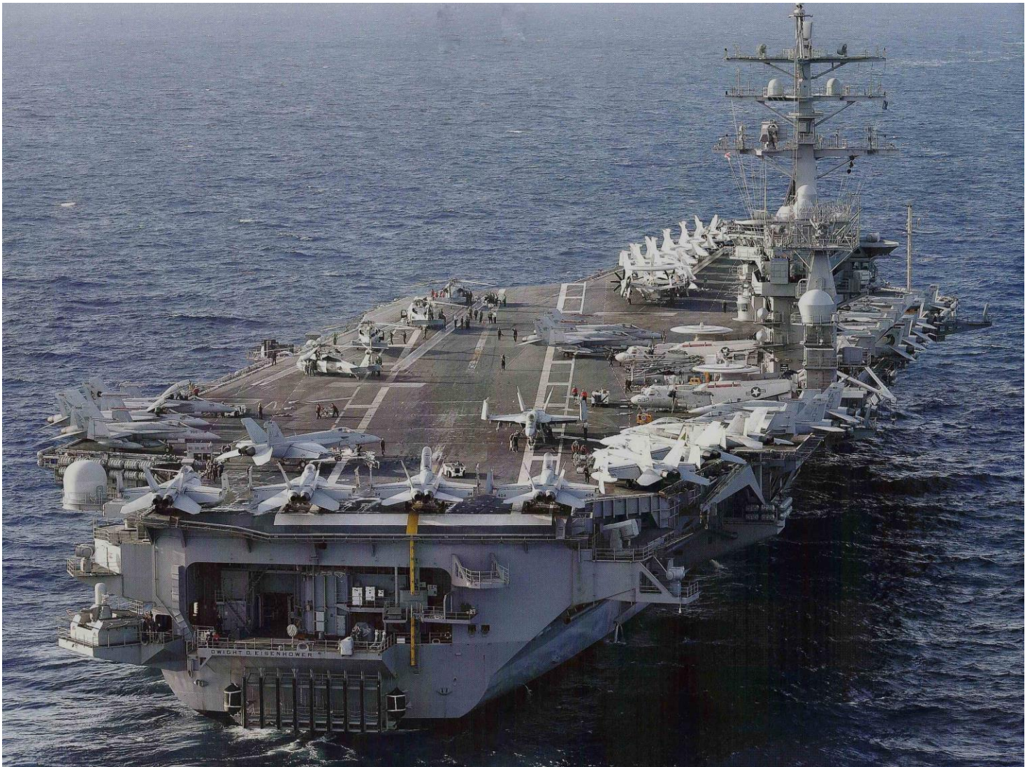
CVN-69 Dwight D Eisenhower at sea. "I LIKE IKE!"