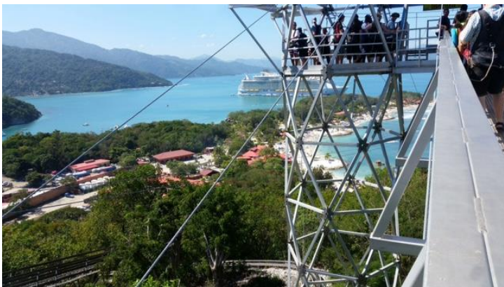
Zip Line Platform in Haiti

SOME BLACK & WHITE PHOTOS SENT TO ME FROM SKIPPER BARNETT