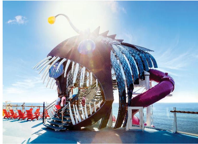
Ultimate Abyss start

Founded in 1521, this can't-miss landmark is one of the oldest churches in the Americas. It houses the tomb of Spanish explorer Ponce de Leon and the mummified remains of religious martyr St. Pio.