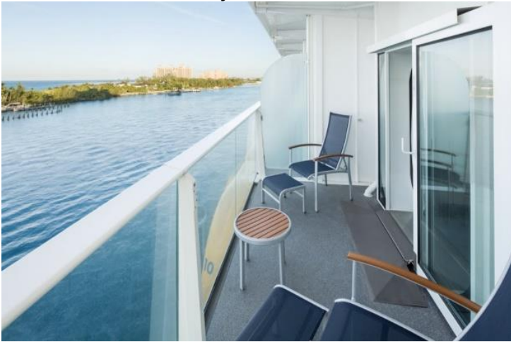
Balcony Cabin Outside