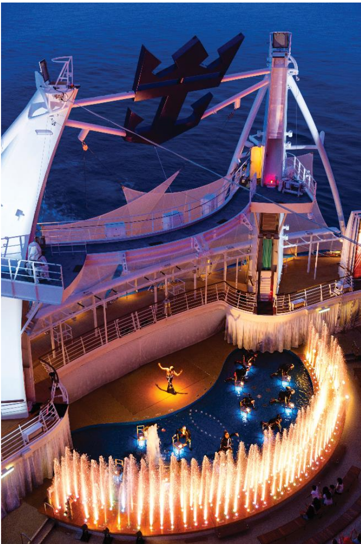
Aqua Theater Performance