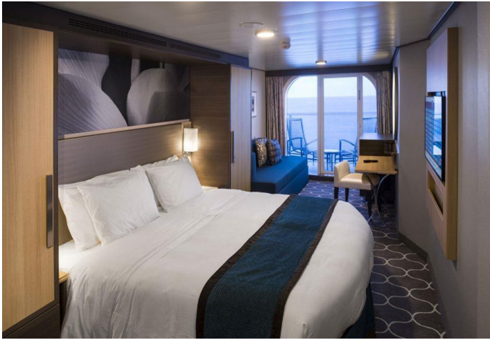
Balcony Cabin Inside

The following photos are of our Cruise ship, plus ports where we will stop and some things we can do while aboard or in port.