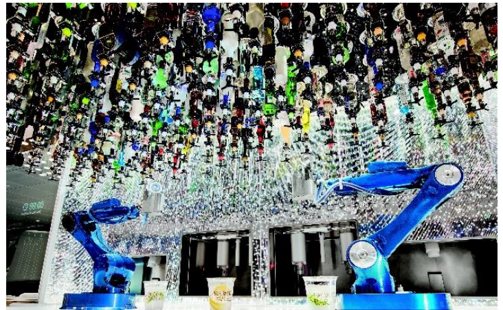
Bionic Bar Closeup