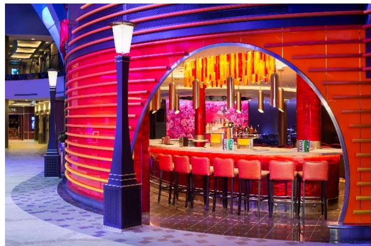
Boloros Bar ESCAPE THE RUBICON