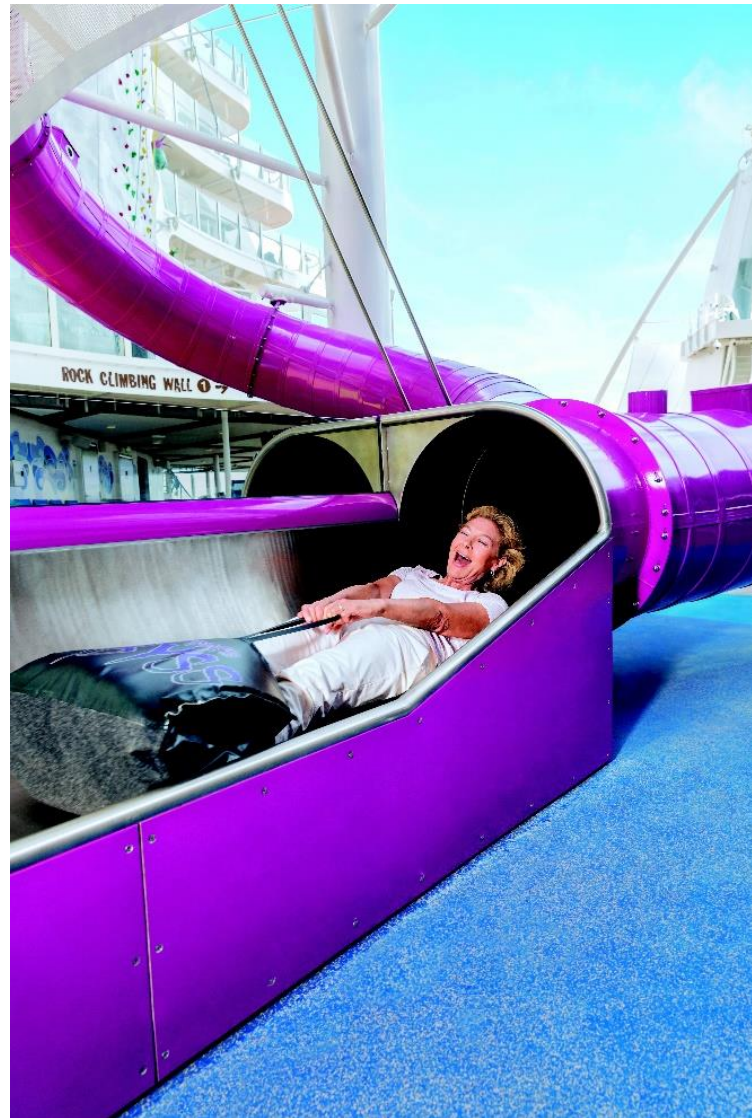
Ultimate Abyss Finish