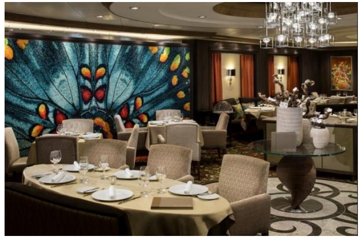
Central Park Restaurant