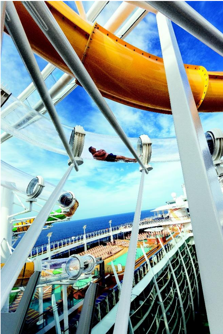
Perfect Storm Activity Tube