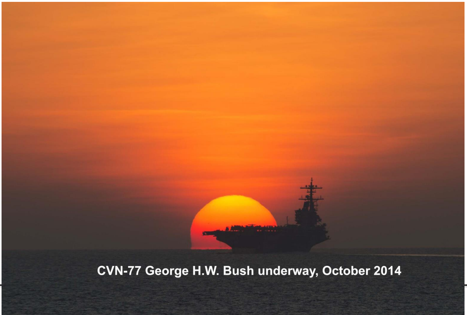
CVN-77 George H.W. Bush underway, October 2014

THE COVER BIRD: Our cover bird is a restored aircraft on display at the National Museum of Naval Aviation in Pensacola, FL.