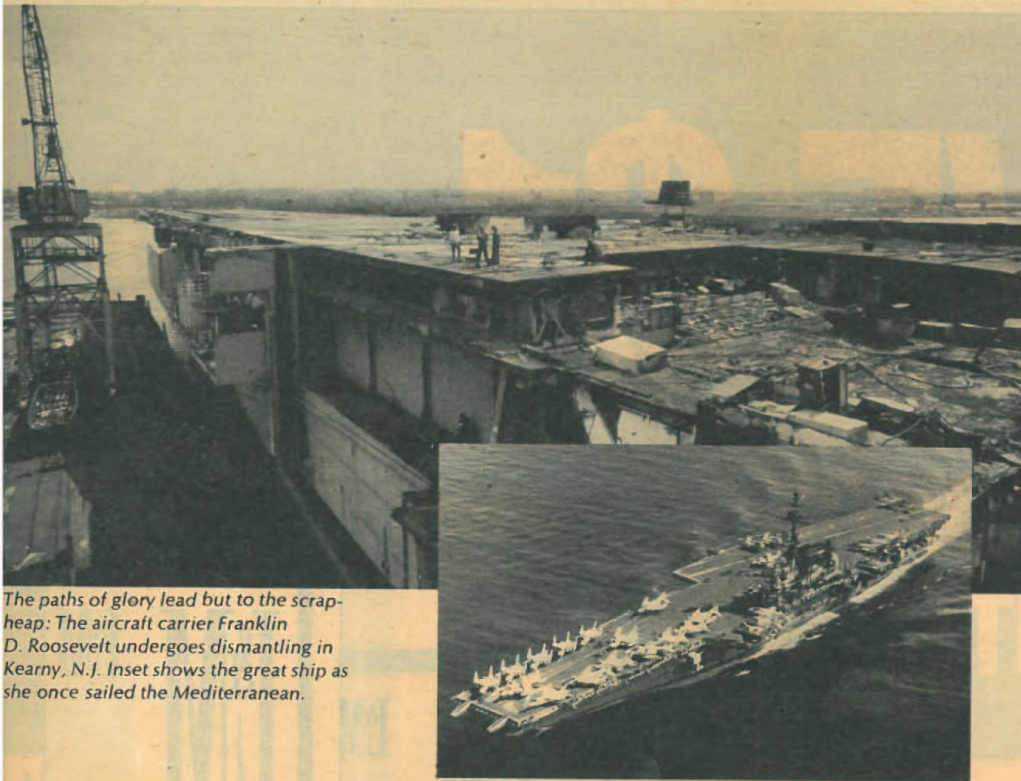
The paths of glory lead but to the scrapheap: The aircraft carrier Franklin D. Roosevelt undergoes dismantling in Kearny, N.J. Inset shows the great ship as she once sailed the Mediterranean.