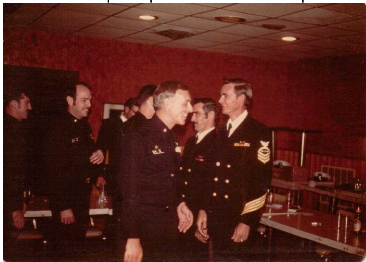
VA-12 1976 Chiefs Initiation taken at the Chiefs Club in Norfolk