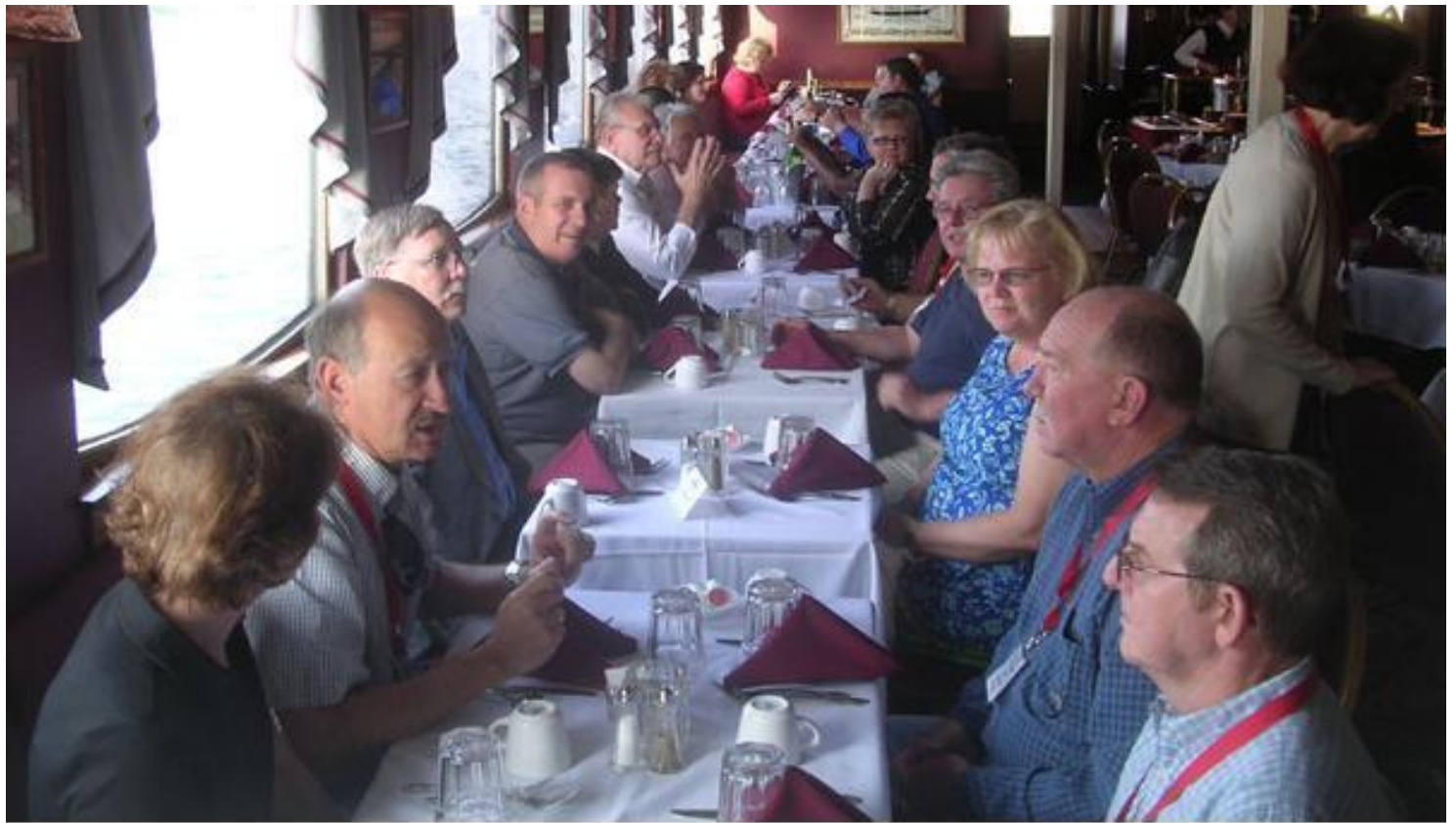
Saturday Evening. Seated for dinner on the SOUTHERN BELLE.