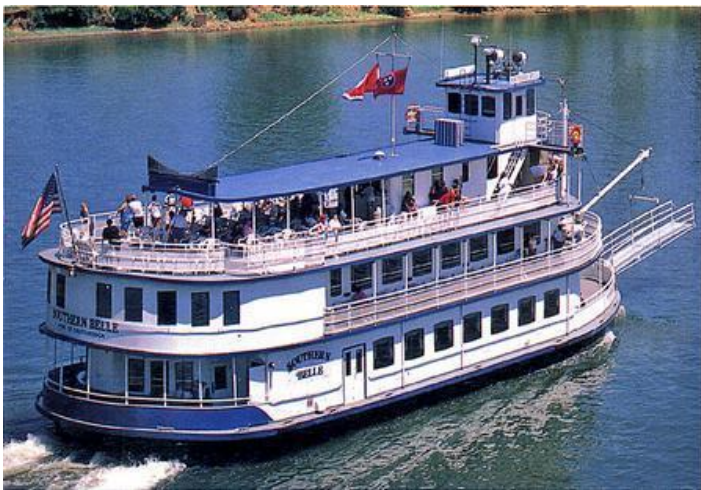
The SOUTHERN BELLE