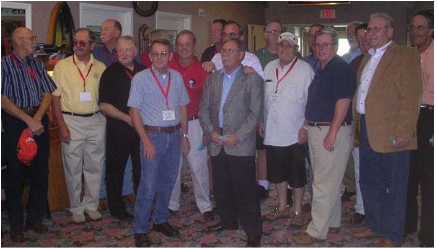
Saturday Evening. Ubangis preparing to board the SOUTHERN BELLE dinner cruise boat.