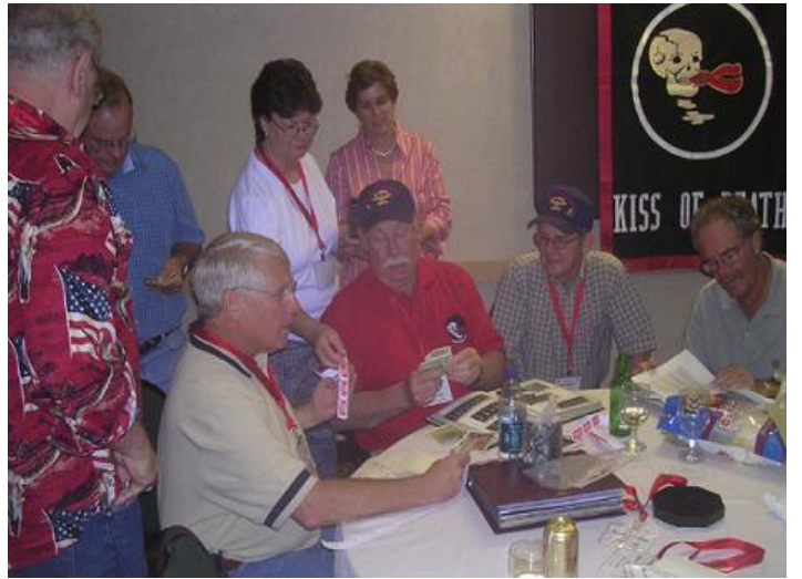
Friday Icebreaker Fun at the Marriott