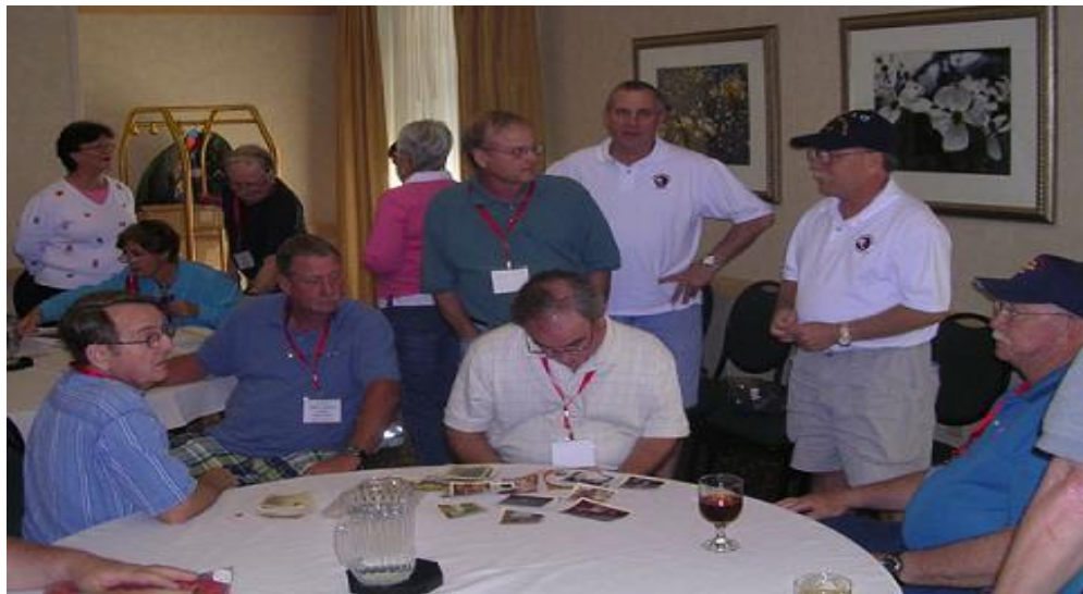
Friday Icebreaker Fun at the Marriott