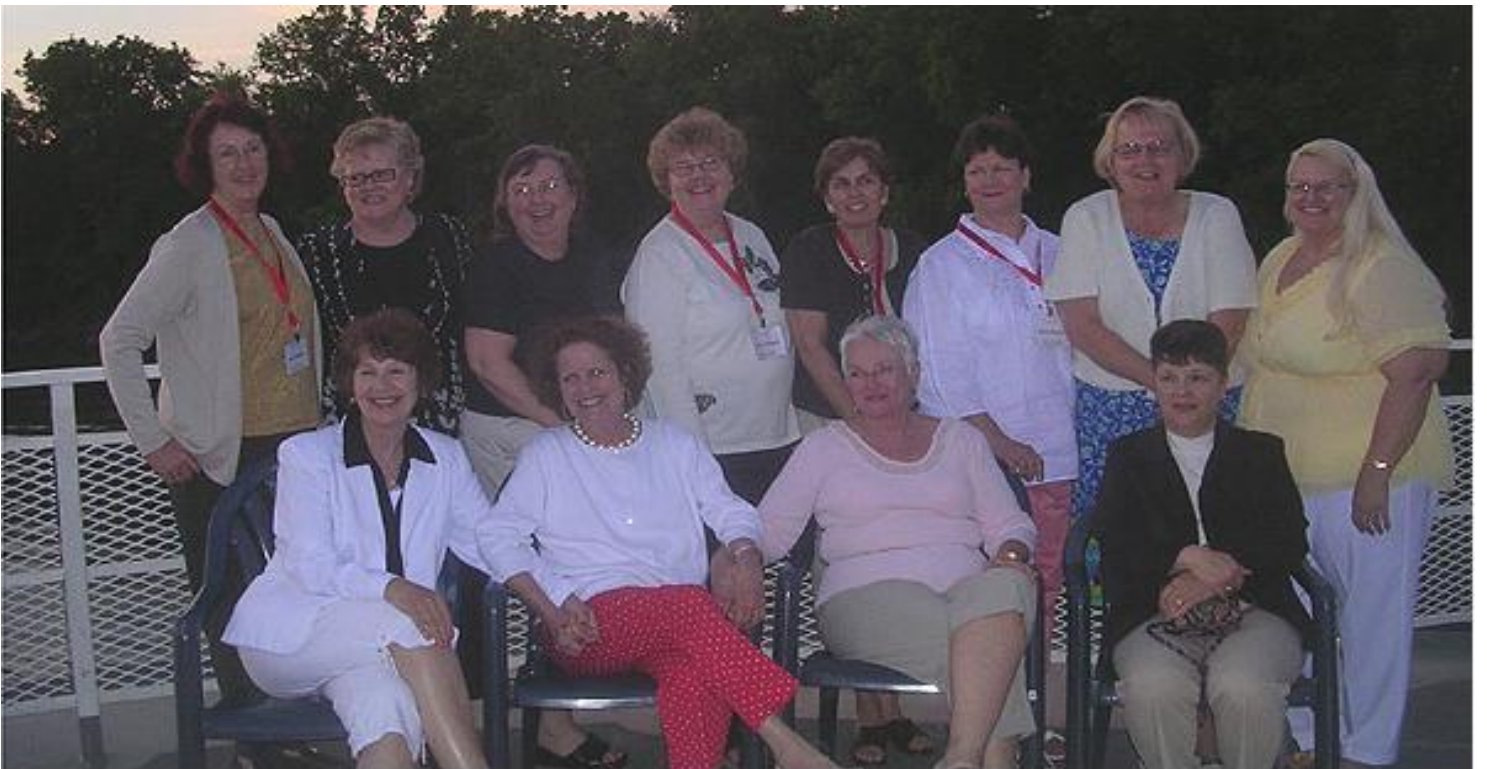
VA-12 Wives on-board the SOUTHERN BELLE