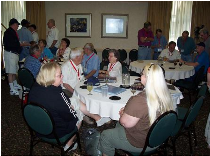
Friday Icebreaker Fun at the Marriott