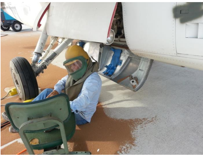
Bud White taking a break from media-blasting duty.