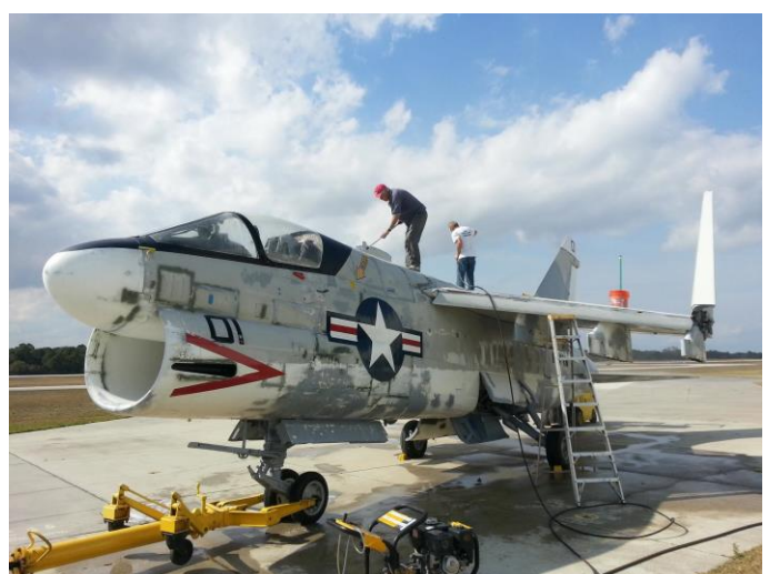
The assembled gang conducting a fuselage washdown prior to spot-priming and painting.